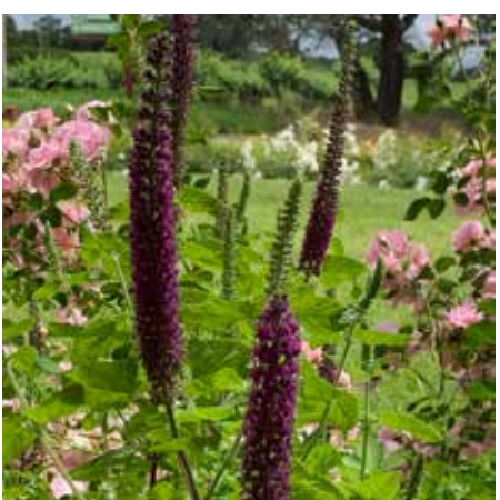
Teucrium hyrcanicum Purple Tails