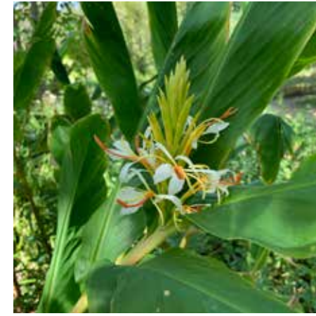
Hedychium spicatum var. acuminatum Ginger Lily