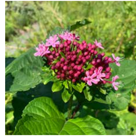
Clerodendrum bungei Cashmere Bouquet or Rose Glory Bower