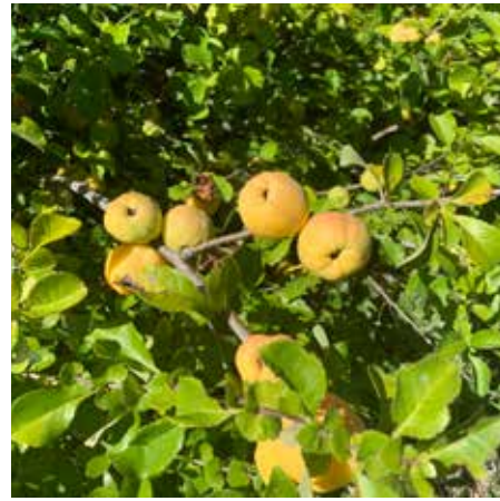
Chaenomeles japonica Japanese Quince — Fruit