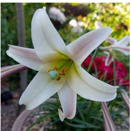
Lilium formosanum Formosa Lily or Taiwanese Lily