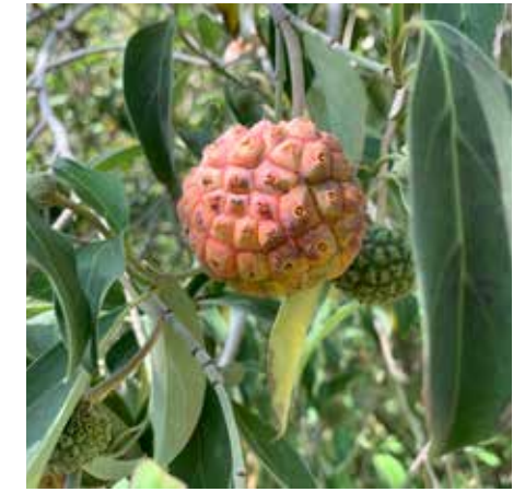
Cornus Capitata Evergreen Dogwood — Fruit