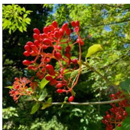
Viburnum sieboldii var. obovatifolium Siebold Viburnum