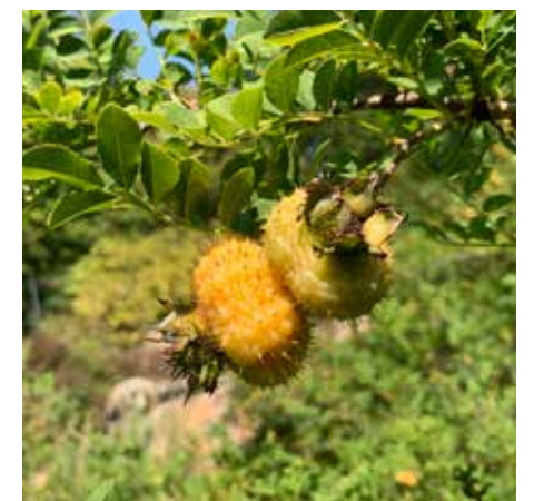
Rosa roxburghii fo. normalis Chestnut Rose — Hip