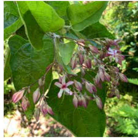
Clerodendrum trichotomum Harlequin Glorybower