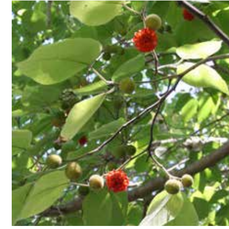
Broussonetia papyrifera Paper Mulberry