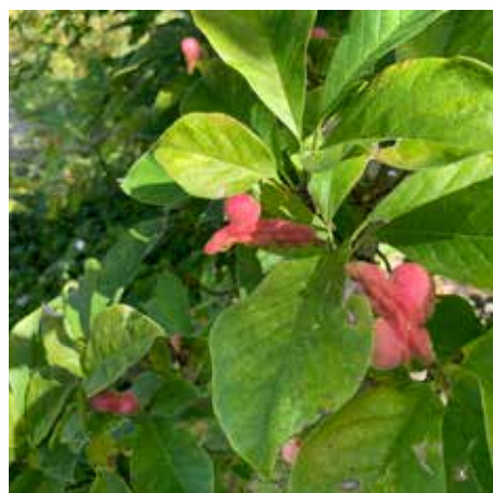
Magnolia Seed Pods