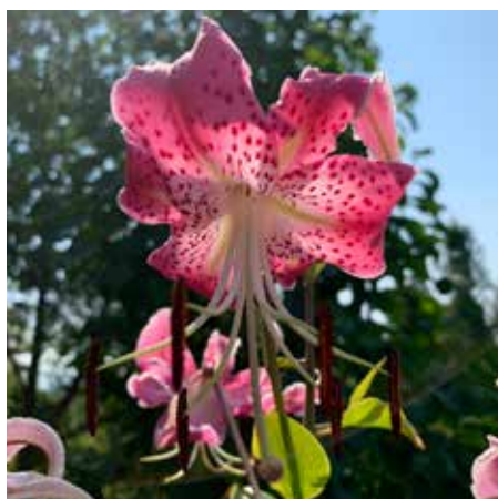
Lilium speciosum var. speciosum Japanese lily