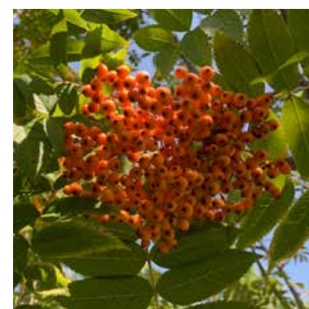
Sorbus commixta var. wilfordii Japanese Mountain Ash