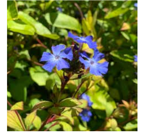
Ceratostigma Chinese Plumbago