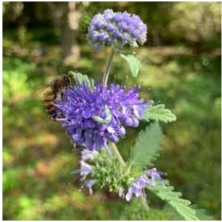
Caryopteris incana Bluebeard