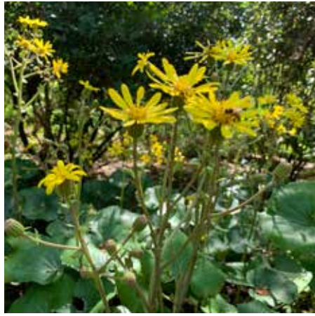
Ligularia tussilaginea ( Farfugium japonicum ) Green Leopard Plant