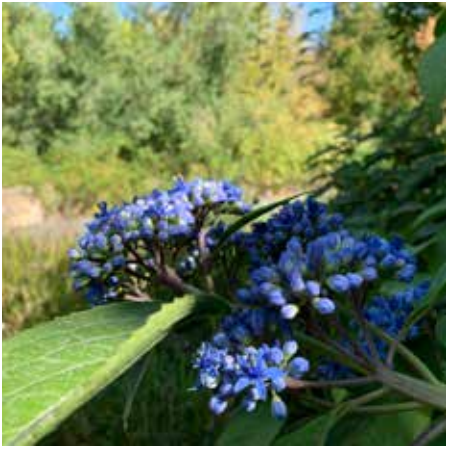
Dichroa febrifuga Blue Evergreen Hydrangea