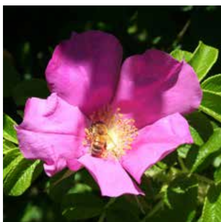
Rosa rugosa Beach Rose or Japanese Rose