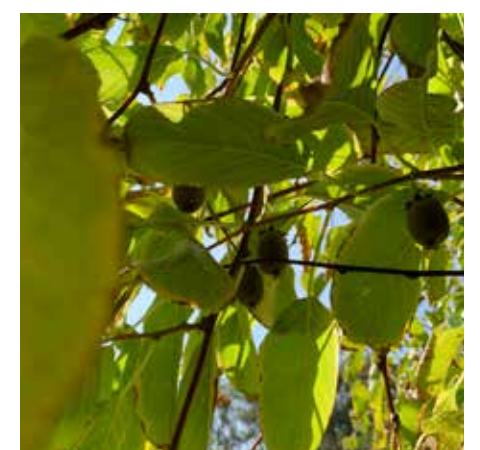
Tiny Kiwis on Arbor