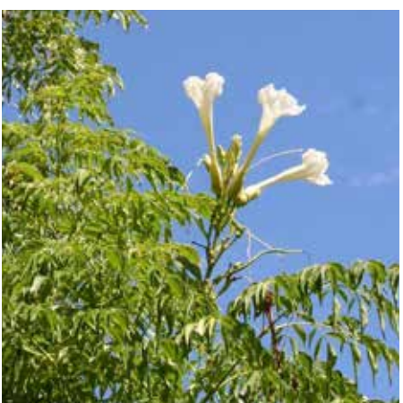
Radermachera sinica China Doll Plant