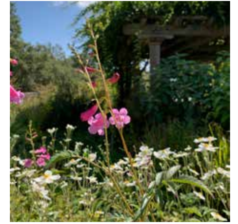
Incarvillea arguta Himalayan or Summer Gloxinia