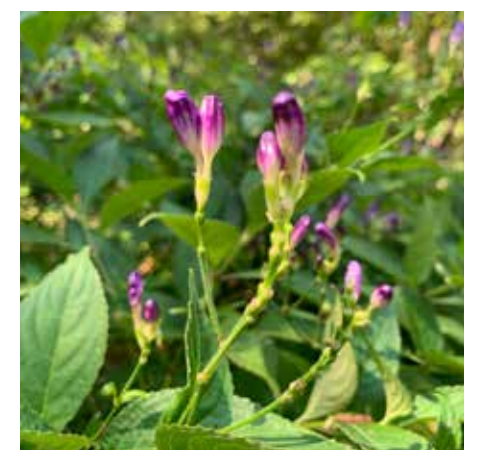
Strobilanthes penstemonoides var. dalhousiana