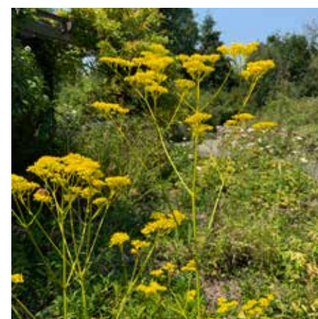
Patrinia scabiosifolia Yellow Patrinia