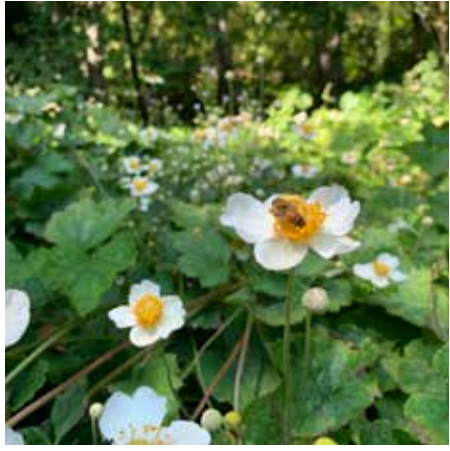
Anemone hupehensis Chinese or Japanese Anemone