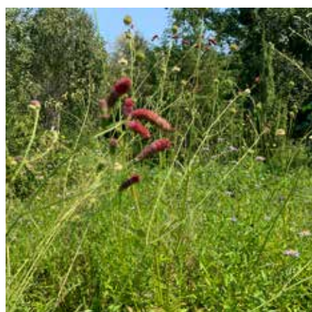
Sanguisorba officinalis Great Burnet