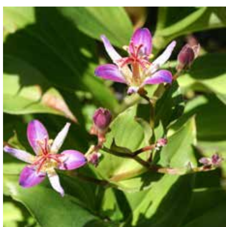
Tricyrtis lasiocarpa Toad Lily