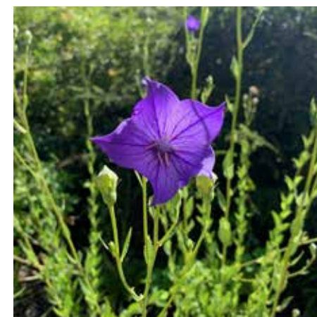
Platycodon grandiflorus Balloon Flower