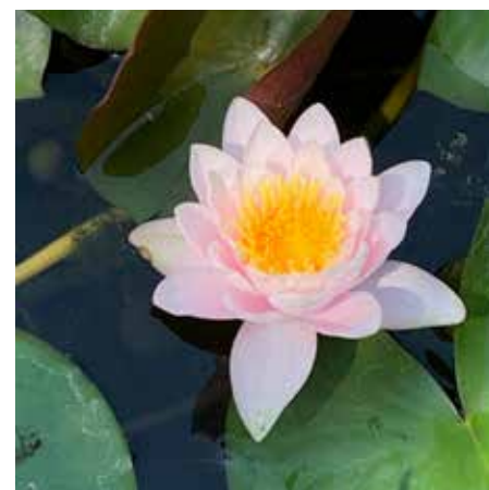
Nymphaeaceae Water Lilies