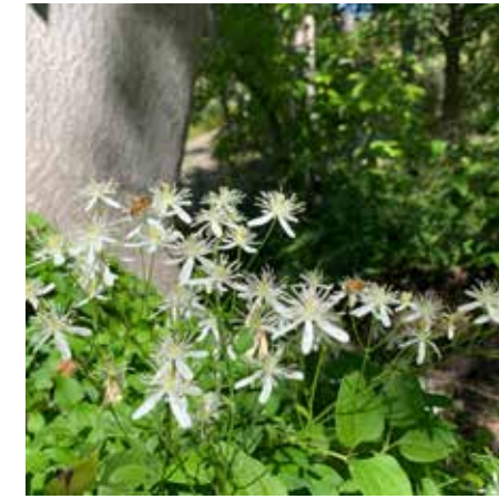
Clematis maximowicziana Sweet Autumn Clematis