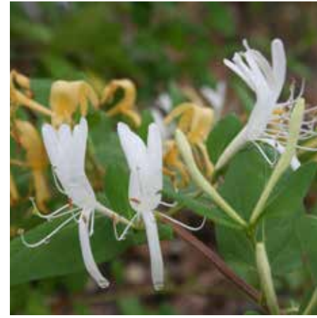
Lonceria japonica Chinese Honeysuckle