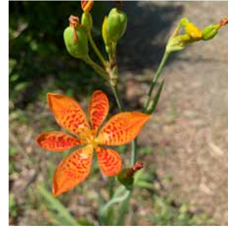
Belamcanda chinensis Blackberry Lily or Leopard Lily