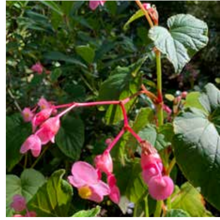
Begonia grandis ssp. grandis Hardy Begonia