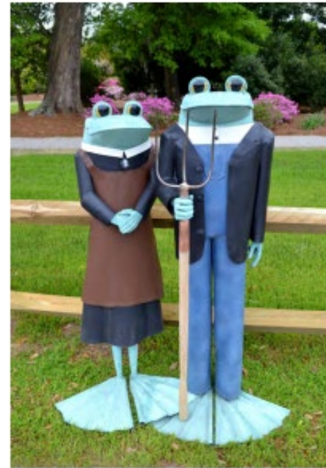
American Frog Gothic