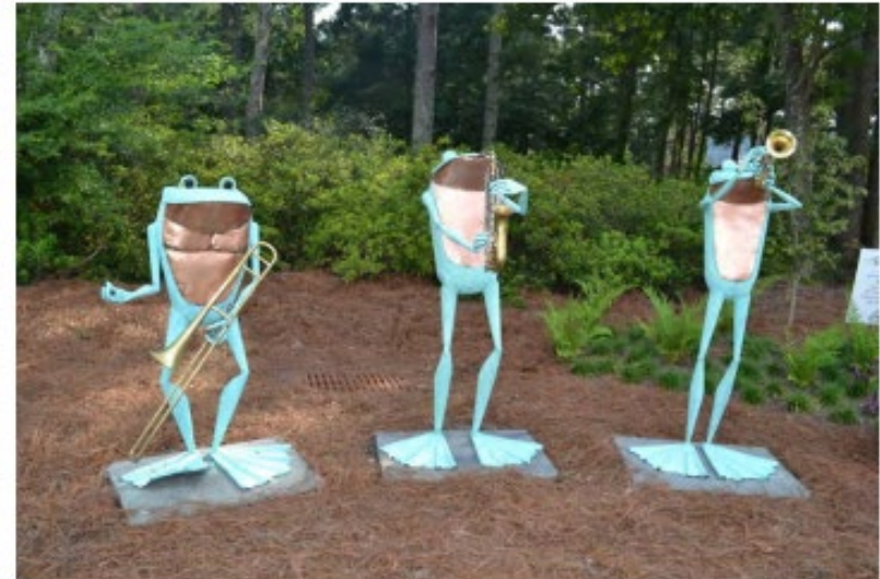
Trombone Shorty, Charlie Parker, and Miles Davis.