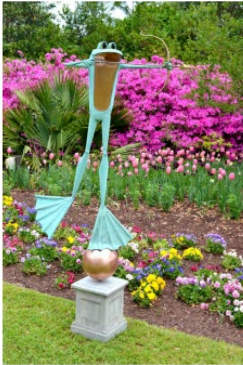
Diana the Huntress

Roman goddess of the hunt, the moon, and of birth