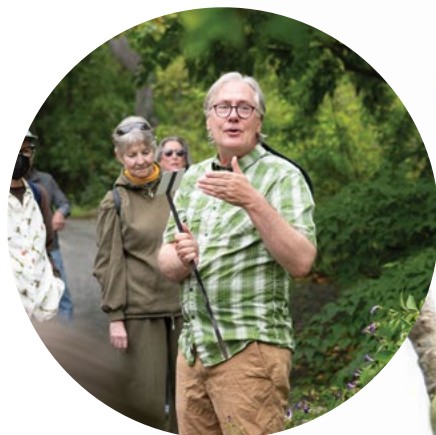
Magnolia liliiflora, Purple Lily Magnolia

Your journey begins in our Cabernet Sauvignon vineyard, where you'll be welcomed by the lush, fertile landscape of Sonoma Valley. From there, wander through our native California oak savanna and woodland, which showcase the unique natural beauty of the state. Your adventure concludes in the Asian Garden, where rare and endangered plants offer a global glimpse into some of the vibrant ecosystems of the Pacific Rim. Each section of the Garden invites you to experience and appreciate the diverse and captivating world of plants.