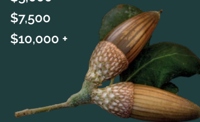
Quercus agrifolia, Coast Live Oak

Please note: Donations and Memberships are classified differently. While a donation is tax deductible, only a portion of a membership may be written off. The amount depends on the level of membership. Sonoma Botanical Garden IRS EIN (Tax ID): 68-0249110. Contact membership@sonomabg.org with questions.